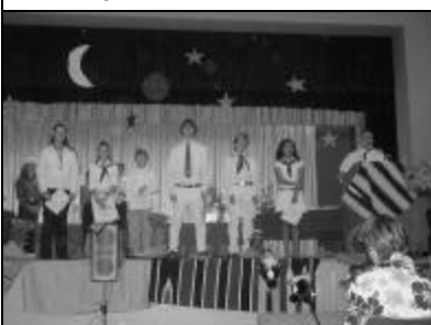
Young Achiever bond winners

If you are a 4-H member with web design computer skills, the SLO Co. 4-H website could use your help. The website has a lot of potential but the site needs more member volunteers to keep up with the 4-H Office updates, website upgrades, and ideas to improve the website in order to meet the needs of SLO Co. 4-H members and volunteers. Call the 4-H Office at 781-5943, if you are interested or if you have any questions.