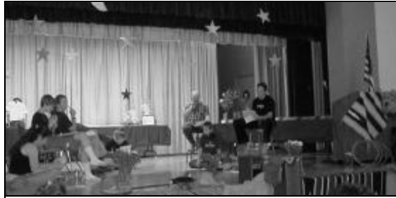
SLO County 4-H All Stars, practicing and planning