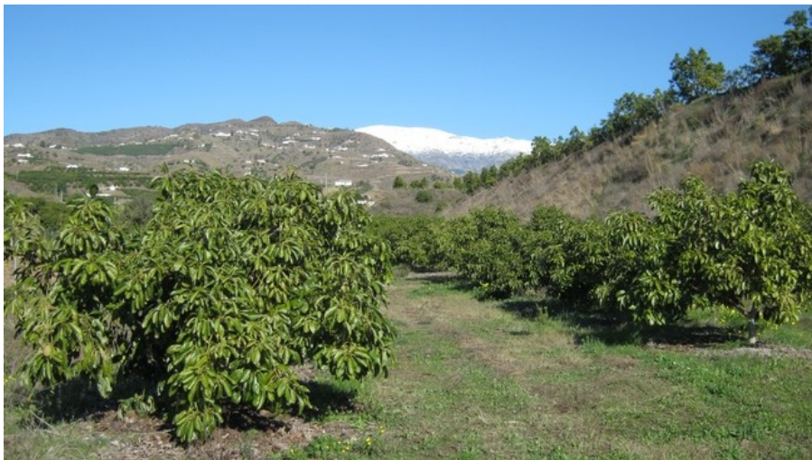
Avocado Grove in Spain

There is Phytophthora root rot there, but it is not as extensive as in our industry. Phytophthora disease control is done as here with mulches and phosphonates. One of the major sources of mulch was shells from the almond industry. With the eclipse of the almond industry, the shells have become very expensive and are going into other products. They are developing a yardwaste collection system, but it is