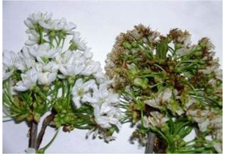
Good flowers on left, damaged flowers on right.

This pest is not yet found in the United States. However, this is an example of a pest that could be very destructive to many different California crops. In this case, though, we already have a potential method for control.