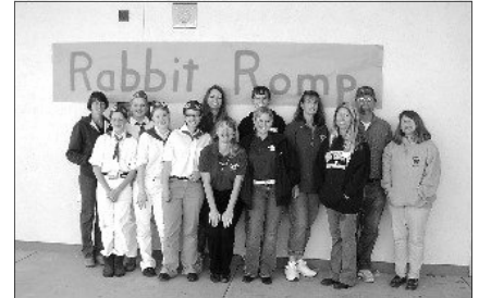
Rabbit Romp Planning Committee