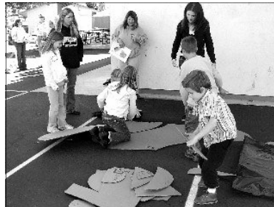
These 4-H members are identifying rabbit parts as they make a rabbit!