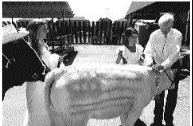
El Camino prepares for the big wedding!

At the end of the fair. Everyone pitches in to clean up, round up the animals, load up the vans, trucks and trailers. New friends have been made and the goodbyes are hard to say. Hugs and promises of keeping in touch are said quietly. Handshakes and congratulations. But most of all you hear, "I can hardly wait til next year."