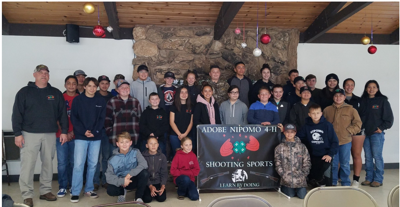
First meeting for Adobe Nipomo 4-H Shooting Sports Shotgun Group of the new 2019/2020 year.

A National 4-H Western Heritage Workshop will be held in Winton, (Merced County) California in the spring of 2020. The training will start on Monday, April 13 th at 6:30 p.m. and conclude Thursday, April 16 th at 7:00 p.m. at the River Oaks Firearms Training Center https://safetyfirstshooting.net/ . This is a National Level II training and requires attendees to be state certified and experienced in at least one 4-H shooting sports discipline. More details will be released in a few weeks. For now, mark your calendars and save the date!