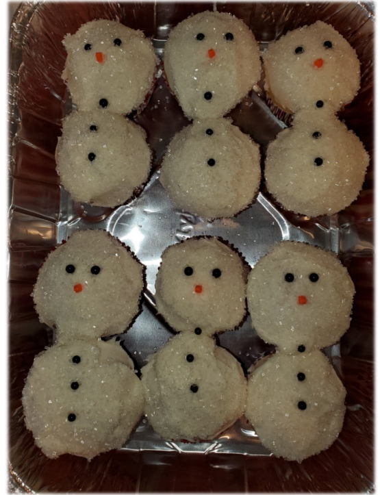
More Pictures from Last Month's Cake Decorating Workshop