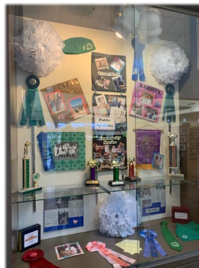
Picture 2: Nipomo 4-H put together a display all about 4-H. It can be seen at the Nipomo Library. Submitted By: Kaiana S., Nipomo 4-H