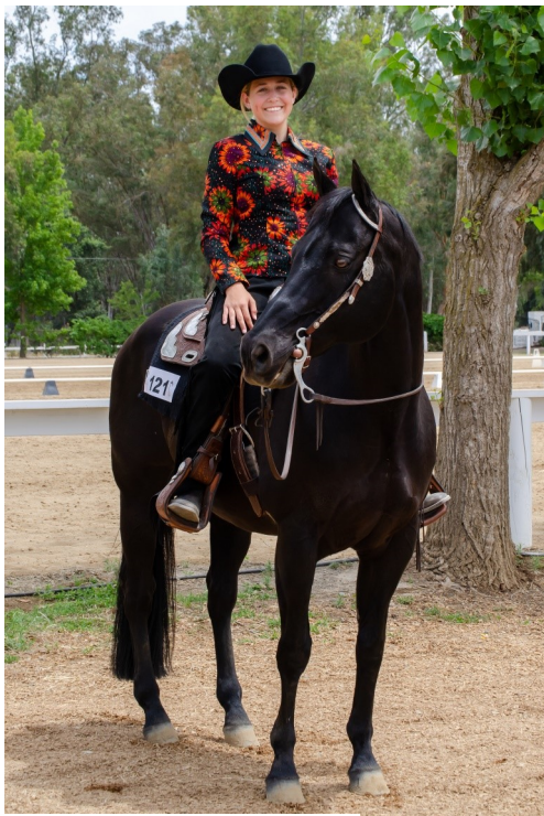
Olivia & Cowboy competed in the English and Western classes, earning 5th place in Novice English Pleasure.