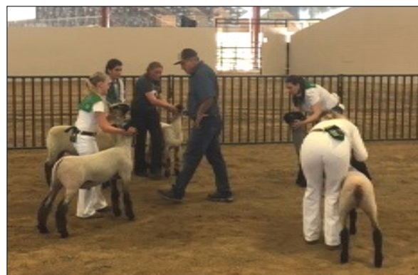
Seniors doing the Texas Star